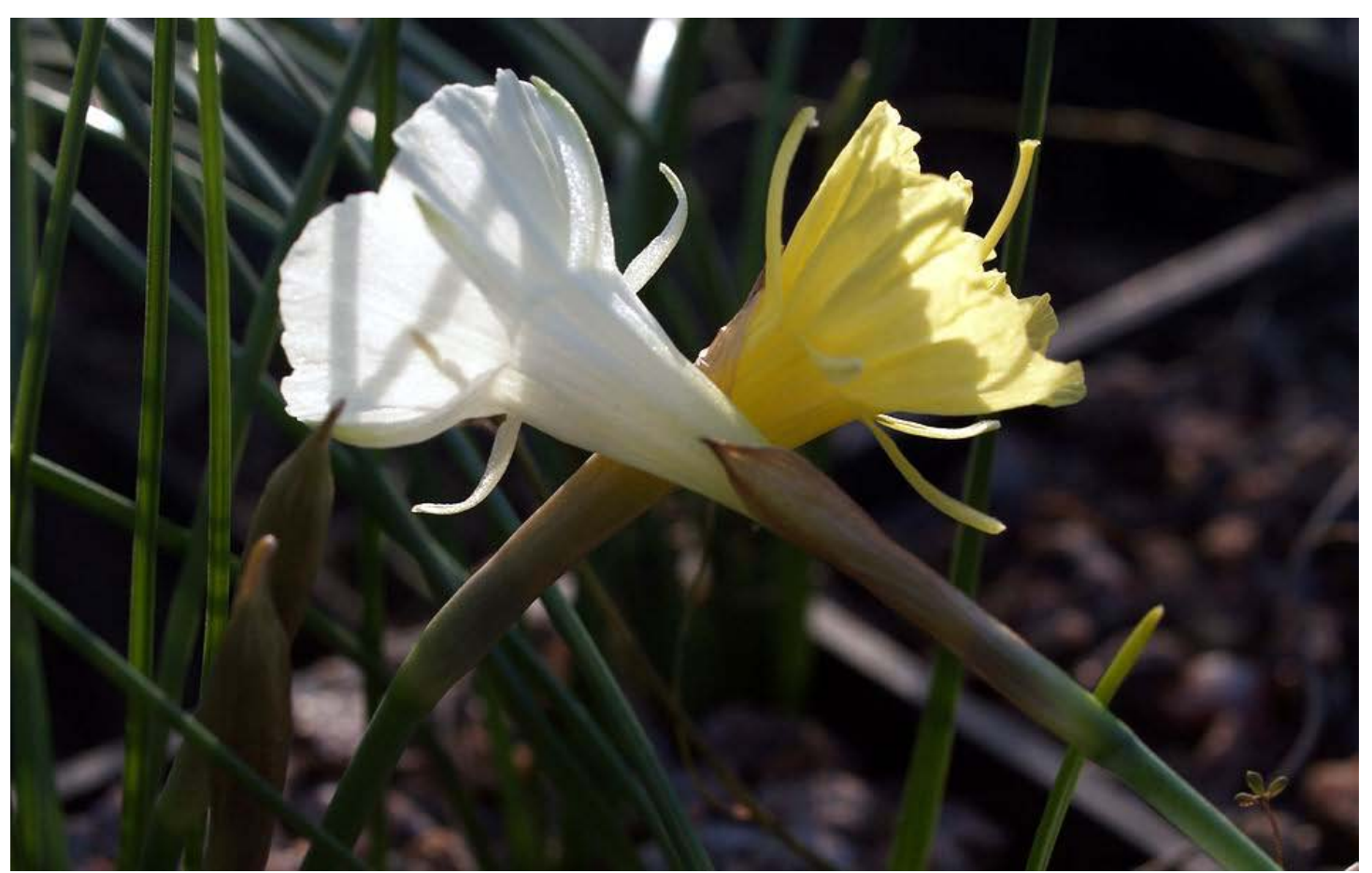
This chance juxtaposition illustrates well the colour variation that seedlings from this group can have.

Another pot of Narcissus 'Don Stead' is still in bud but illustrates well how many flowering stems (30) you can get from a 7cm pot of bulbs if you get the feeding and watering correct. I will of course highlight my regime as we move through the season but for now it is important to maintain reasonable levels of moisture to sustain the plants. In freezing conditions I never water but when we have sunny days I will water where necessary.