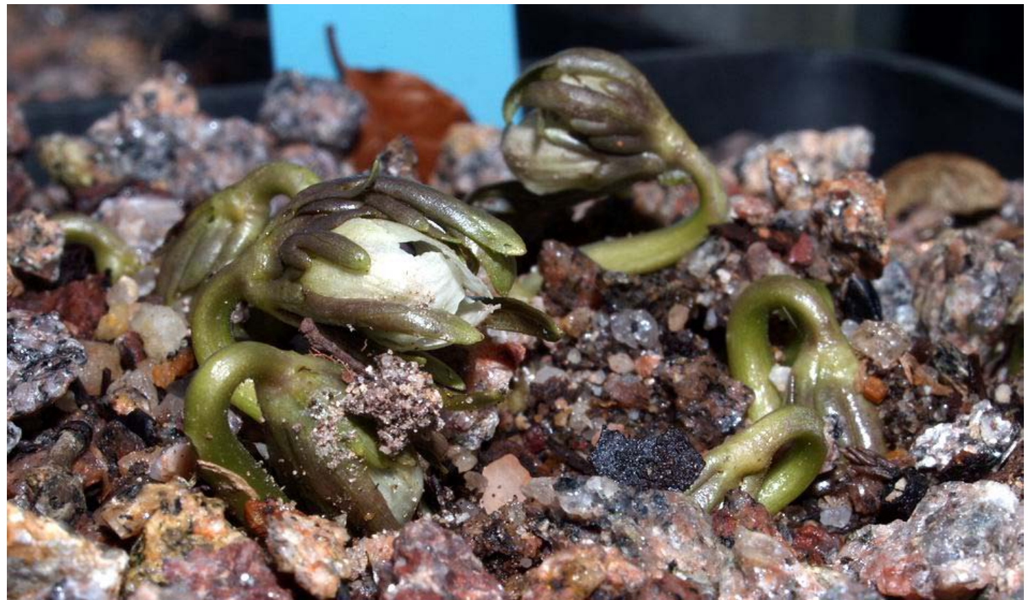
I have moved Eranthis pinnatifida from an open frame to a bulb house partly to protect the emerging flowers from physical damage and slugs but mostly so that I can enjoy their stunning beauty which, as the picture below shows, is revealed even before the flowers are fully formed