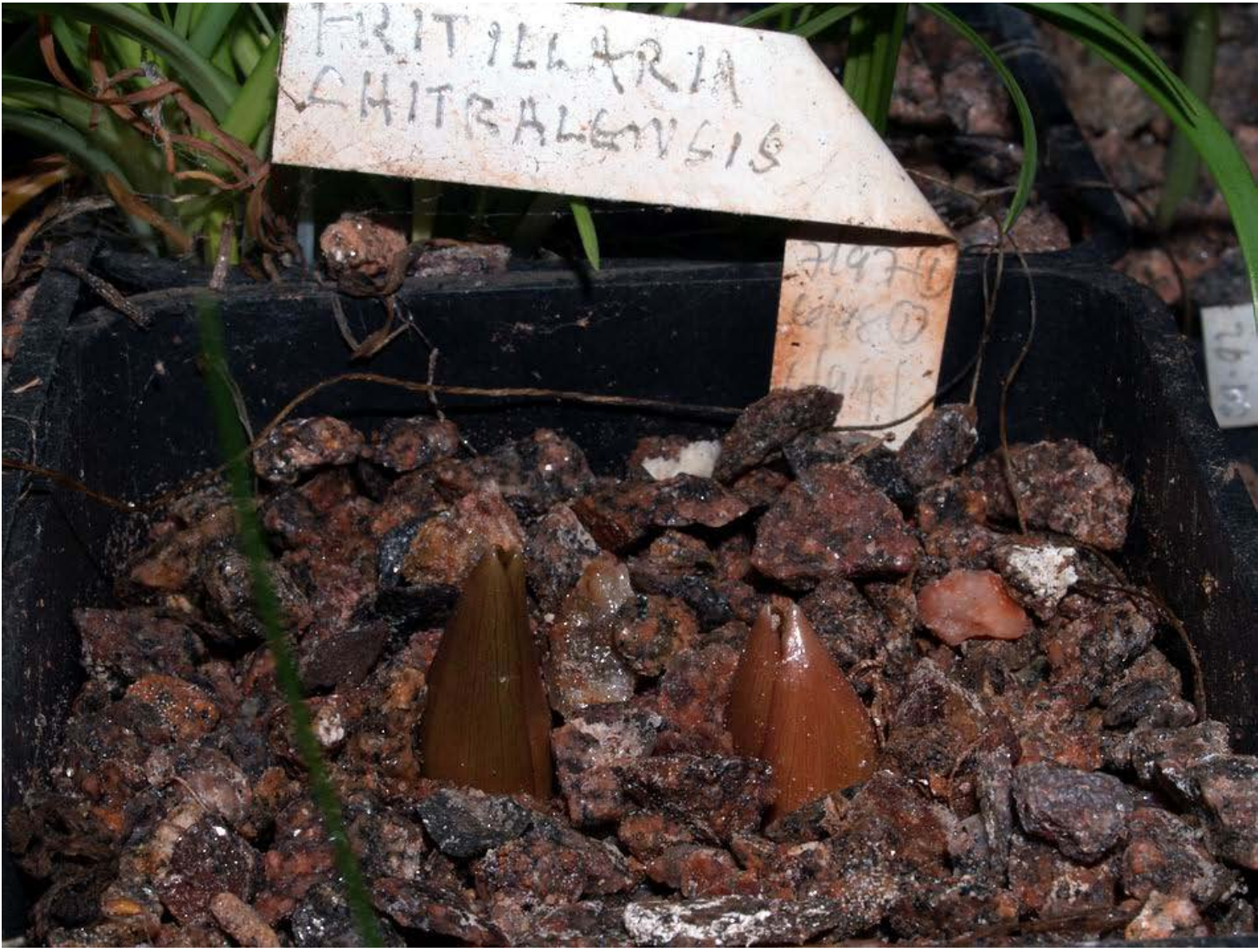
The final two pictures for this week show that the second year seedling leaves of Fritillaria chitralensis emerge at exactly the same time as the shoots of the mature plants poke through. Ignore the stray Narcissus seedling!