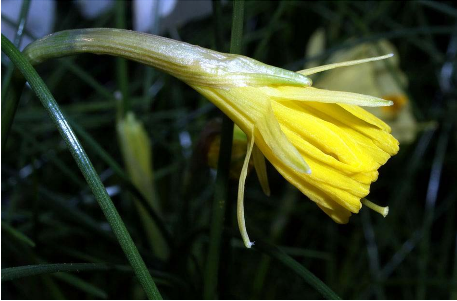
I have observed this feature on the flowers of many bulbs such as Fritillaria but have never been able to understand exactly the purpose they serve.

Also I want to point out that the many small hair like structures that cover the stigma are also evident on the ends of the petals.